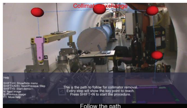
Fig. 3. Image of the prototype developed for collimator exchange. In the image, a ste-by-step guiding system based on keypoints is displayed in order to aid the operator. When the exchange begins, one keypoint is displayed at a time, showing the goal to reach.

Finally, the platform has been developed to be flexible enough to be adapted to different situations and environments. This flexibility has already been demonstrated as the platform has been successfully utilised to develop a new AR-based educational and training solution, as explained in [9].