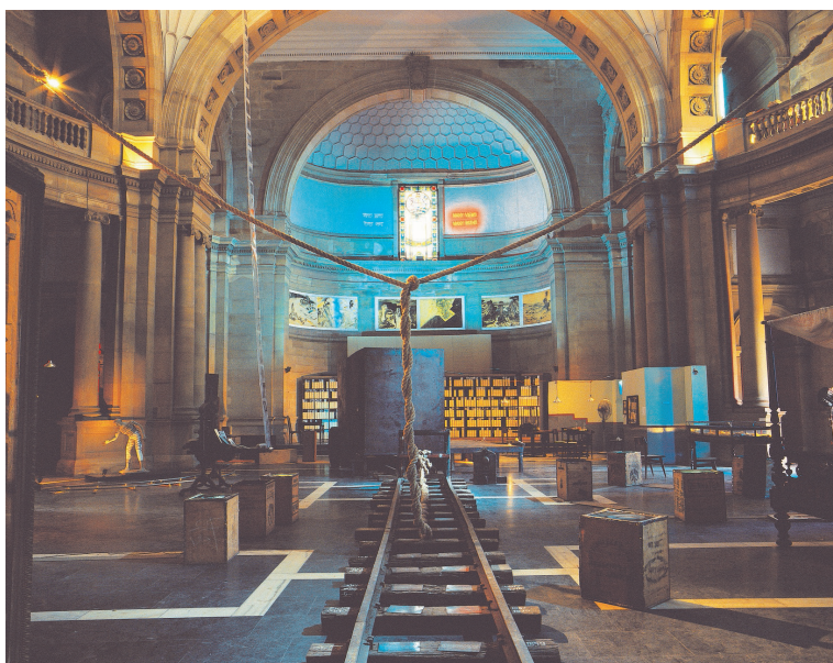
Image 7: Vivan Sundaram, History Project (Victoria Memorial Museum).

In the late 1990s, Sundaram expanded the archival dimension of his work with his History Project . He took a monument to British imperialism, the Victoria Memorial Museum in Calcutta (image 7), still a major museum and tourist attraction, and refunctioned it into a counter-monument by inverting its inherent colonial meanings