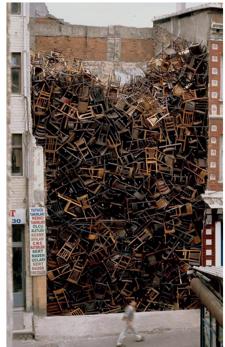
Image 3: Doris Salcedo, 1550 Chairs, Installation, Istanbul Biennial 2003.

As opposed to Salcedo, Boltanski has left the space of the missing house empty, but in painstaking research he found the names, professions, and dates of birth and death of the Jewish and non-Jewish renters who had lived in the building during the Third Reich before it was destroyed in a bombing attack in 1945.