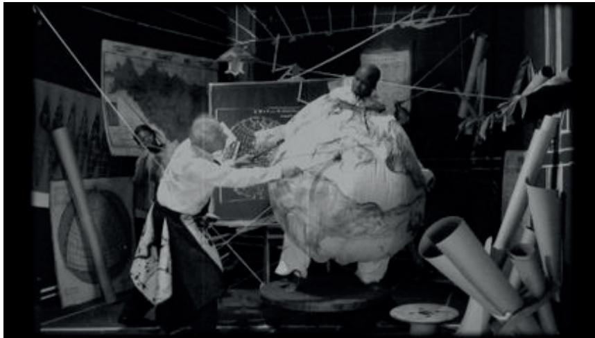
Image 11: William Kentridge, Refusal of Time (Map Room with globe like figure on turn table).

pumping of time used in late 19th-century Paris to coordinate time across the city's clocks;]] bellowing like an elephant, it combines the organic and the mechanical dimensions of time regimes and their measurement.